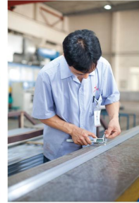
检测型材 Testing profiles