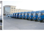
运输车队 Transportation Fleet

■ Storage and transportation department | 34~35