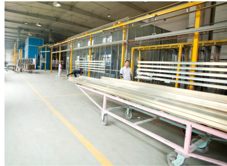
氟碳喷涂生产线 Fluorocarbon Spraying Line

The Surface Treatment Branch Factory has 5 static powder spraying lines imported from Hexion and DSM, 1 wood-grain line, 1 fluorocarbon line, 1 oxidation line and 1 electrophoresis line, and the annual surface treatment capacity is 600,000 tons of profiles.