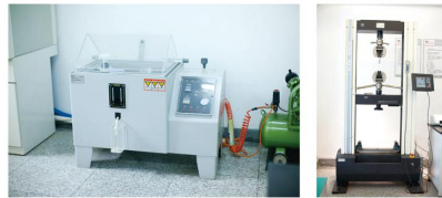
盐雾试验机 Salt Spray Tester 拉力试验机 Tensile Strength Tester

The Physical and Chemical Center boasts 1 German Spectro spectrometer, 1 electronic universal tester (produced by Changchun KeRong), 1 fully control spectrophotometer (produced by Shimadzu), 2 Japanese CR-10 color difference instrument, 2 American imported furnace temperature testing instrument and other advanced analyzing and testing instruments such as electronic balance, eddy current thickness measuring instrument, indentation tester, glass meter, metal ball density, pendulum ring gauge, electric conductivity gauge, constant temperature and humidity cabinet, etc, which can be used for analyzing chemical composition, mechanical performance, surface treatment, bath liquids and industrial waste water concerning the aluminum profiles.