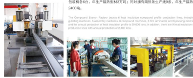
开齿机 Gartering Machine

The Compound Branch Factory boasts 6 heat insulation compound profile production lines, including 6 gartering machines, 6 assembly machines, 6 compound machines, 6 film lamination and glazing machines, and the annual production of heat insulation profiles is 20,000 tons; in addition, there are 9 heat insulation strip production lines with annual production of 2,400 tons.