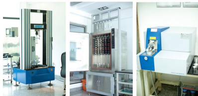
电子式万能材料试验机 Electronic universal material tester 高温持久试验机 High temperature testing boiler 光谱仪 SPECTRO MAXX