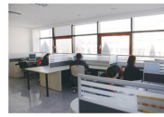
储运部一角 A Corner of Storage and transportation Department

The Storage and Transportation Department with an area of 20,000 sqm can store over 4,000 tons of profiles and boasts over 90 transport vehicles and an independent distribution center with a distribution network covering each corner of home and abroad. Under the unified planning of the Company and with a team of well-trained talents who holds standard operation skills and high dedicated spirit, the Storage and Transportation Department will provide customers from home and abroad with quality services.