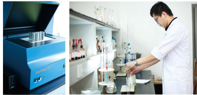
扫描仪 Romshape 化学实验室 Chemical Lab